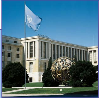
Palais des Nations, Geneva

The Palais des Nations is just a 10-15 minute walk (or 3 minute drive) along Avenue de la Paix from the WMO (see map below). To attend the Symposium, please be certain you have your completed UN Registration Form (provided in your registration packet) and photo identification to present to the UN Security Section at Pregny Gate. Only those who have registered by 17 August and present the necessary form and identification will be granted access to the UN Headquarters for the Public Symposium in Conference Room VII, from 3:00-6:00pm, Tuesday, 28 August.