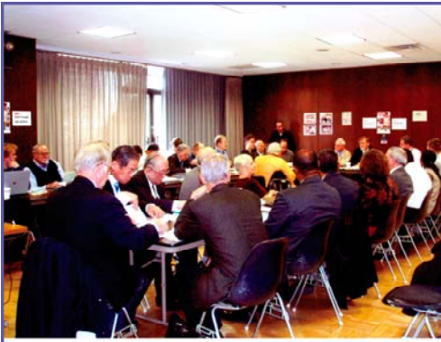
WFM Council Meetings, October 2006, New York

3. Official observers from member organizations shall be entitled to speak but not to vote in commissions.