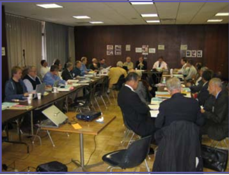
WFM Council Meeting, October 2006, New York